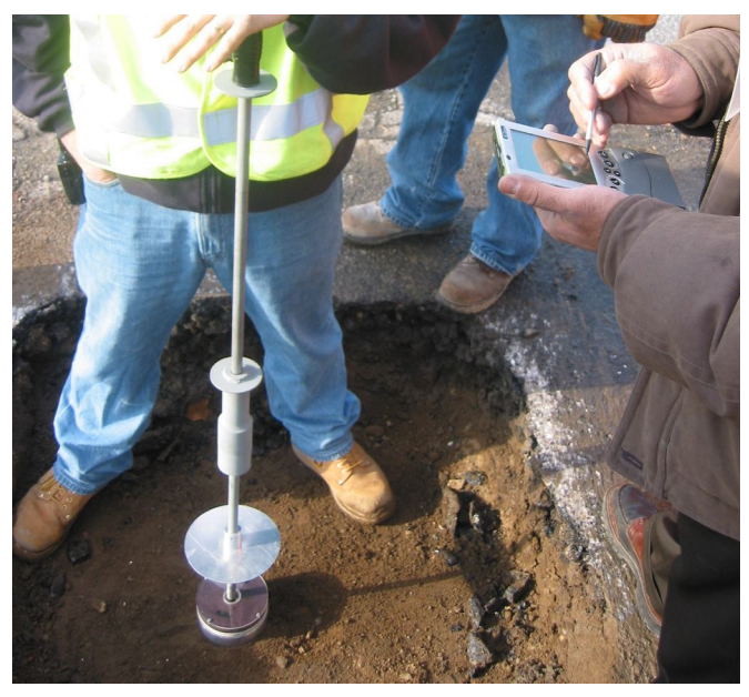
Research has shown the Utility Dynamic Cone Pentrometer to be an attractive, cost-saving alternative to more commonly used soil-compaction-measurement equipment.

As part of the program, utilities performed demonstrations of the Utility DCP for New York City agencies and Department of Transportation regulators to show the potential of the DCP as a cost-effective alternative to the nuclear density gauge.