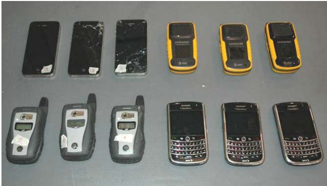
A variety of electric devices were tested.

tions. The approach was to build a facility specific to natural gas to create and maintain a flammable mixture, while permitting operation of an electronic device.